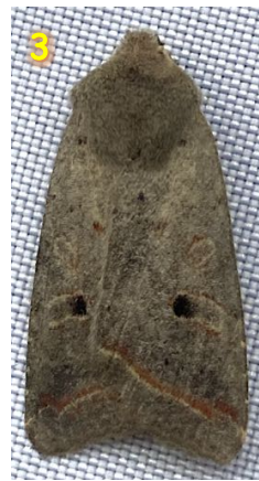
(1) Black Rustic Aporophyla nigra , Adults during September-October, Caterpillars feed on herbaceous and woody plants.