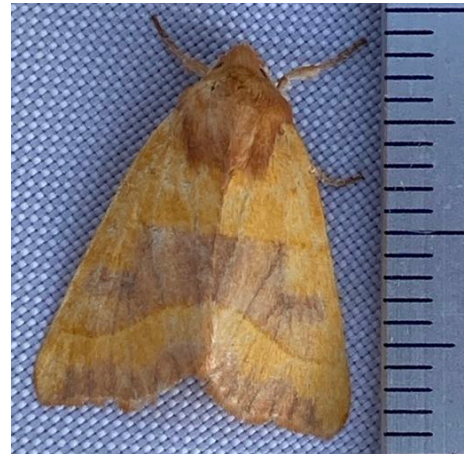
Centre-barred Sallow Atethmia centrigo , Adults flying from August-September, Caterpillars initially feed on ash buds then move to flowers & leaves.