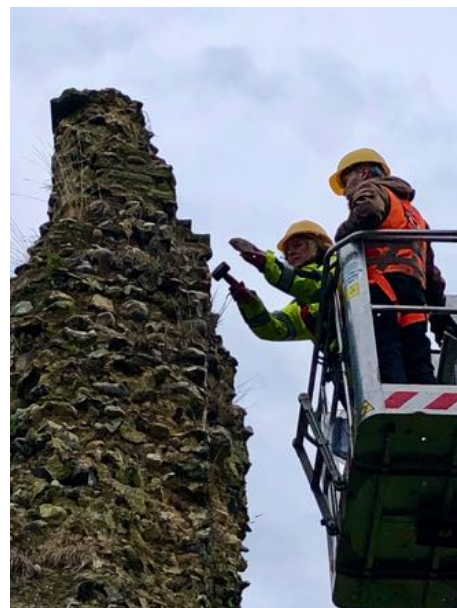
Checking stability of structure