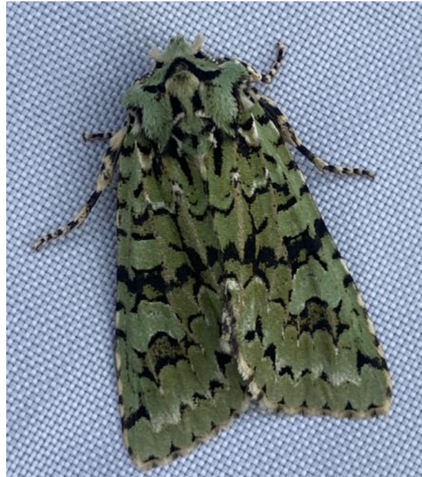
Merveille du Jour Griposia aprilina , Adults from September-October, Caterpillars feed on oak initially on buds and flowers then on leaves as they mature, Adults feed on ivy flowers and overripe berries.