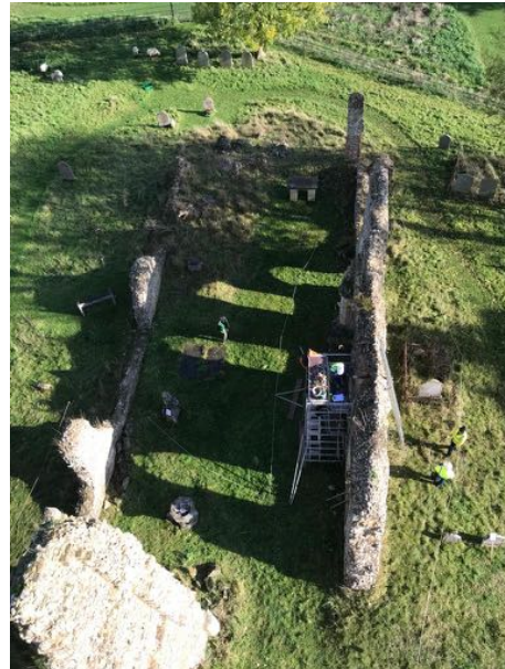
Looking down on the ruins