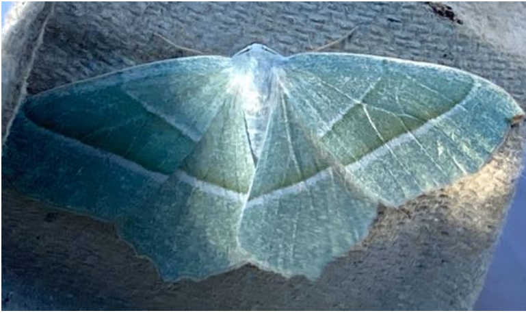
Light Emerald Campaea margaritaria , Adults from May-August & August-October, Caterpillars feed on deciduous trees.