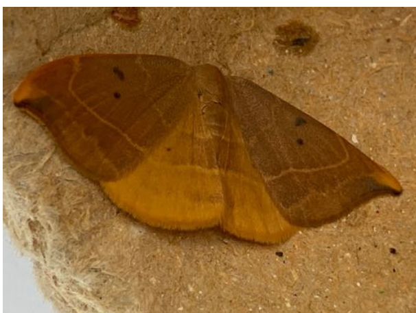
Oak Hook-tip Watsonalla binaria , Adults flying in May-June & July-September, Caterpillars feed on oak leaves.

For this month I'll present some of the moths identified at Foundry Cottage from light trapping during September and October. What still surprises me are the shapes, sizes, colours and patterns of these night-flying insects, and there are some wonderful looking species to be found during Autumn.