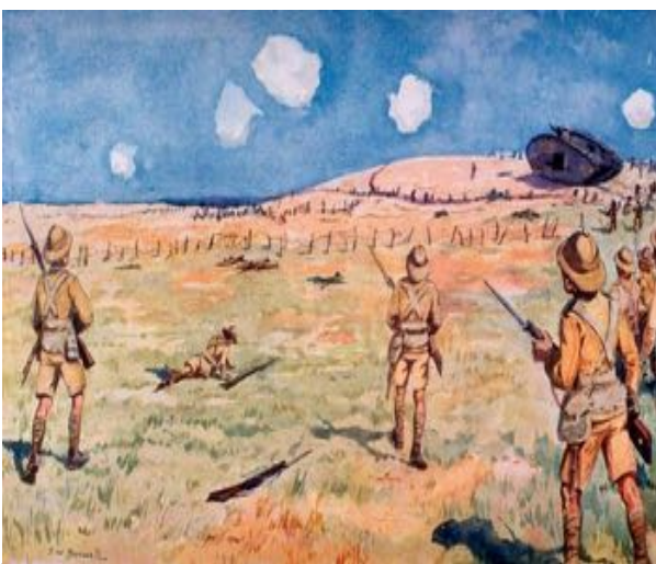
An artist's impression of the Norfolk Territorials' disastrous attack at Gaza on 19 April 1917, showing the tank 'Nuttie' leading the way to the 5 th Battalion's objective, a Turkish redoubt.