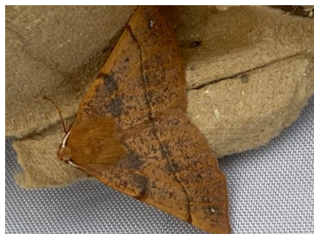
Feathered Thorn Colotois pennaria , Adults from September-December, Caterpillars feed on deciduous trees and shrubs.