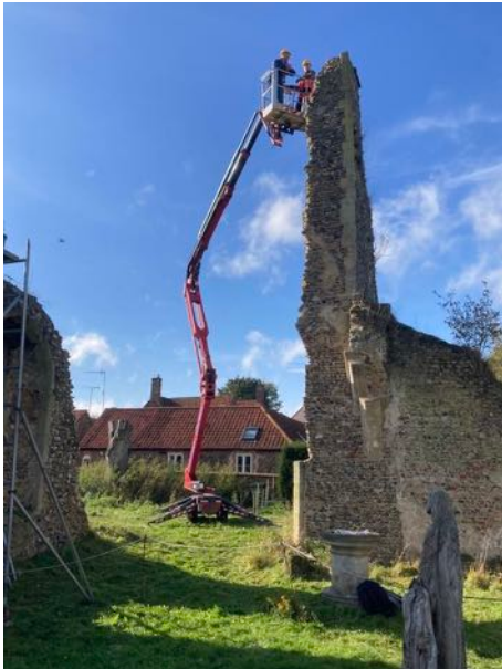
High level inspection in progress

Once we have this information, we will proceed with an application to the Heritage Lottery Fund. We look forward to keeping you updated on our progress. Meanwhile, if you would like any further information, please contact me at alan@sandra-alan.co.uk .