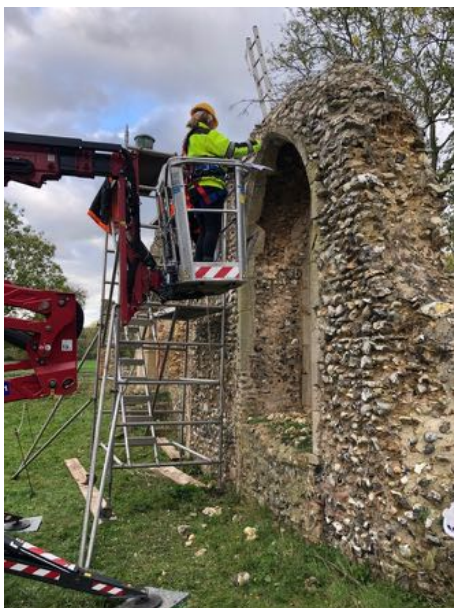
Survey work in progress