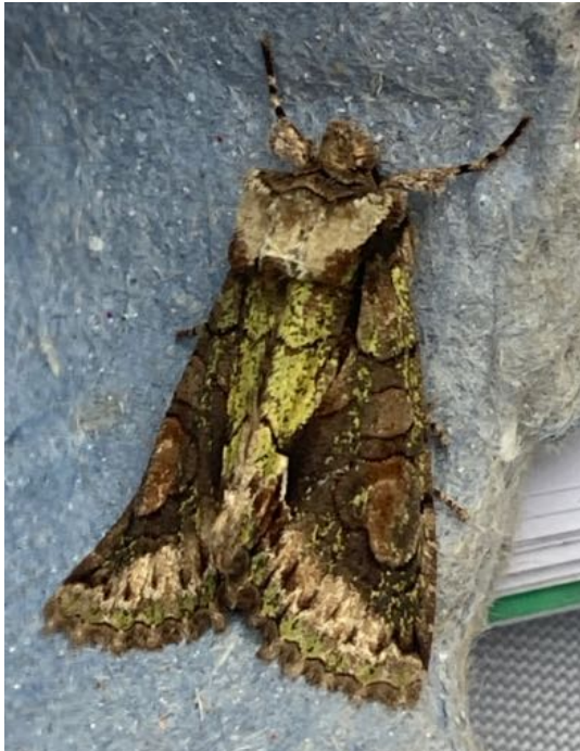
Green-brindled crescent Allophyes oxyacanthae , Adults from September-November, Caterpillars feed on trees and bushes including hawthorn, buckthorn, dog rose and crab apple.