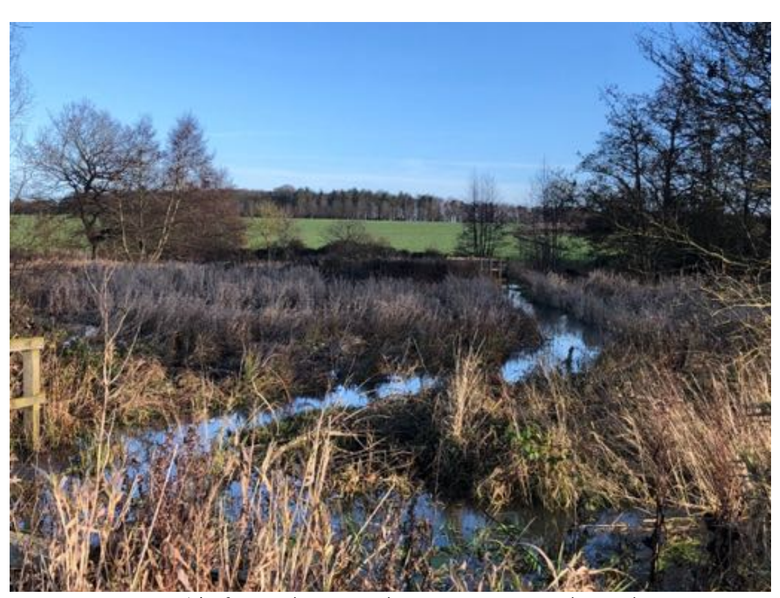
Impassable footpath across the Wensum at South Raynham

Later on, at South Raynham I discovered the Wensum in full spate, with water flowing across the entire width of the riverside woodland belt. Lots of teal were calling from the flooded woodland, although none were visible. More obvious was the brilliant white of a single little egret probing around a marshy pool, and a green woodpecker flew across my path.